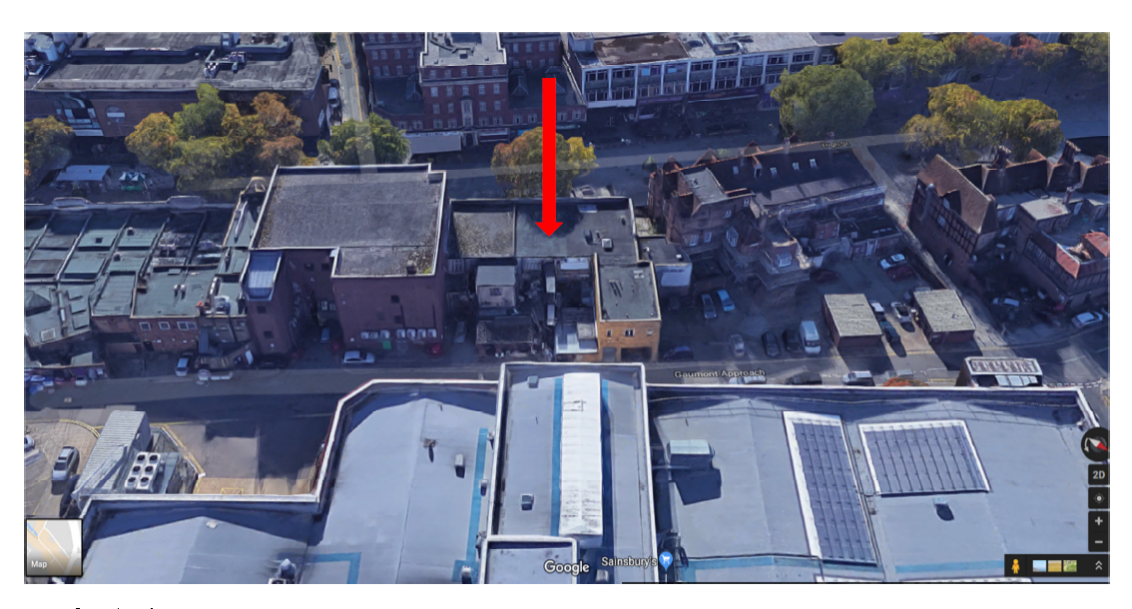
||mage from Google Maps